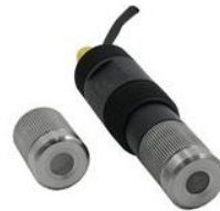
pH / ORP