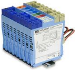
Intrinsic Safety Barriers/Isolators