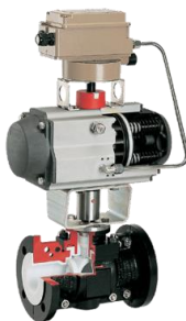
Custom Valves & Actuators