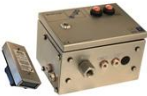
X, Y, Z Purging for Panels