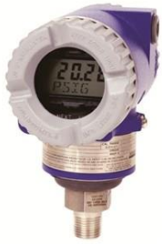
Pressure / Differential