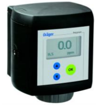
Gas (Tox, LEL, Ox) Detectors