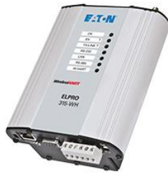
Industrial Wireless Radios/Modems