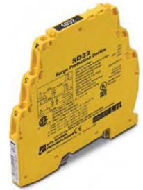
Surge & Isolators