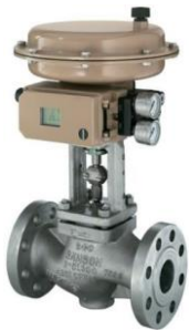
Globe Control Valves