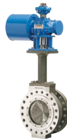
Butterfly Control Valves