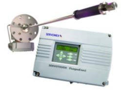
Process Gas Analyzers