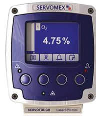
Oxygen Gas Analyzers