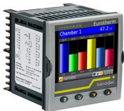
Temperature & Power Controllers