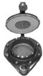
Storage Tank Accessories