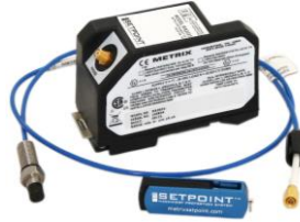
Vibration Proximity Sensors