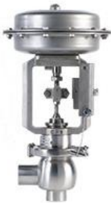
Globe Control Valves