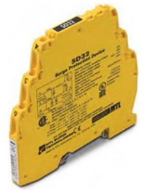
Surge & Isolators