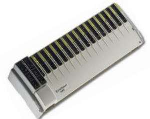
Process Automation Control