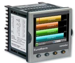
Electronic Data Acquisition