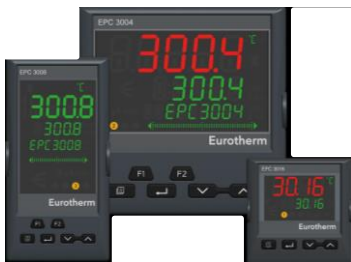
Temperature PID Controllers