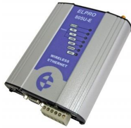
Industrial Wireless Radios/Modems