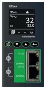
Electric Heat Power Control